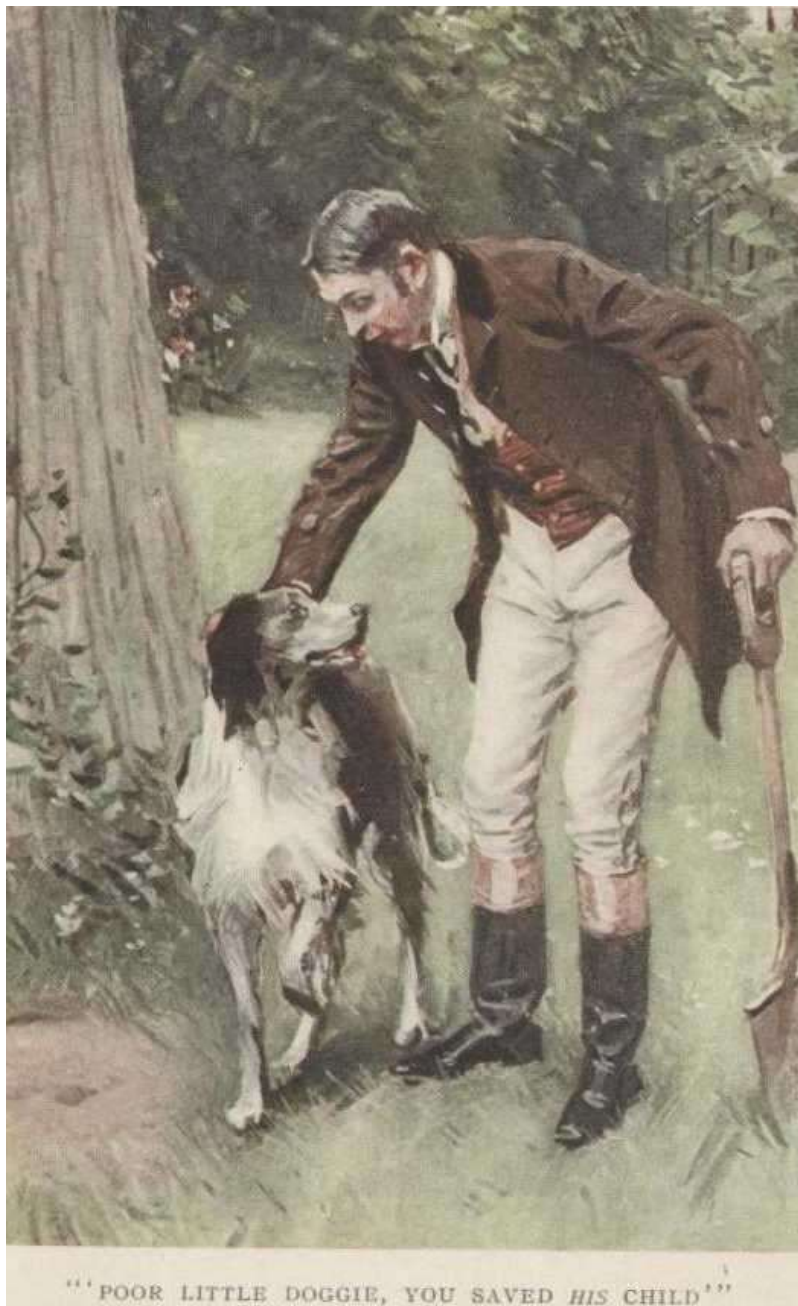
“POOR LITTLE DOGGIE, YOU SAVED HIS CHILD”

I have watched two whole weeks, and he doesn't come up! This last week a fright has been stealing upon me. I think there is something terrible about this. I do not know what it is, but the fear makes me sick, and I cannot eat, though the servants bring me the best of food; and they pet me so, and even come in the night, and cry, and say, “Poor doggie—do give it up and come home; don't break our hearts!” and all this terrifies me the more, and makes me sure something has happened. And I am so weak; since yesterday I cannot stand on my feet anymore. And within this hour the servants, looking toward the sun where it was sinking out of sight and the night chill coming on, said things I could not understand, but they carried something cold to my heart.